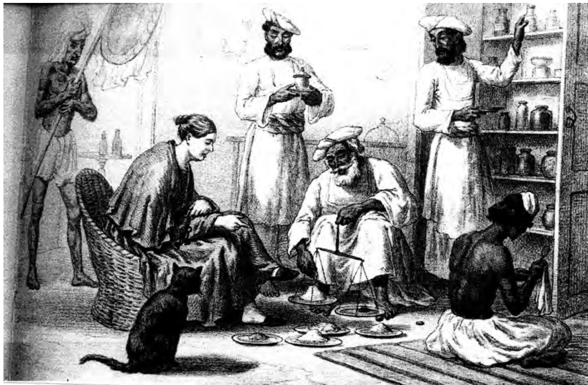
A judge's wife in early nineteenth-century India surrounded by her servants.