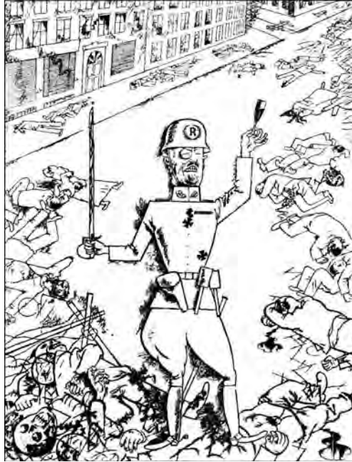
A picture of a Free Corps officer by a German artist. The officer is saying, 'Cheers Noske! The young revolution is dead.'